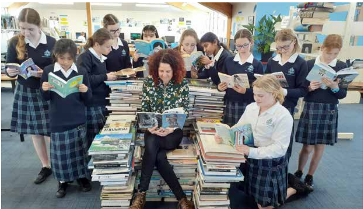
Library Week 2020